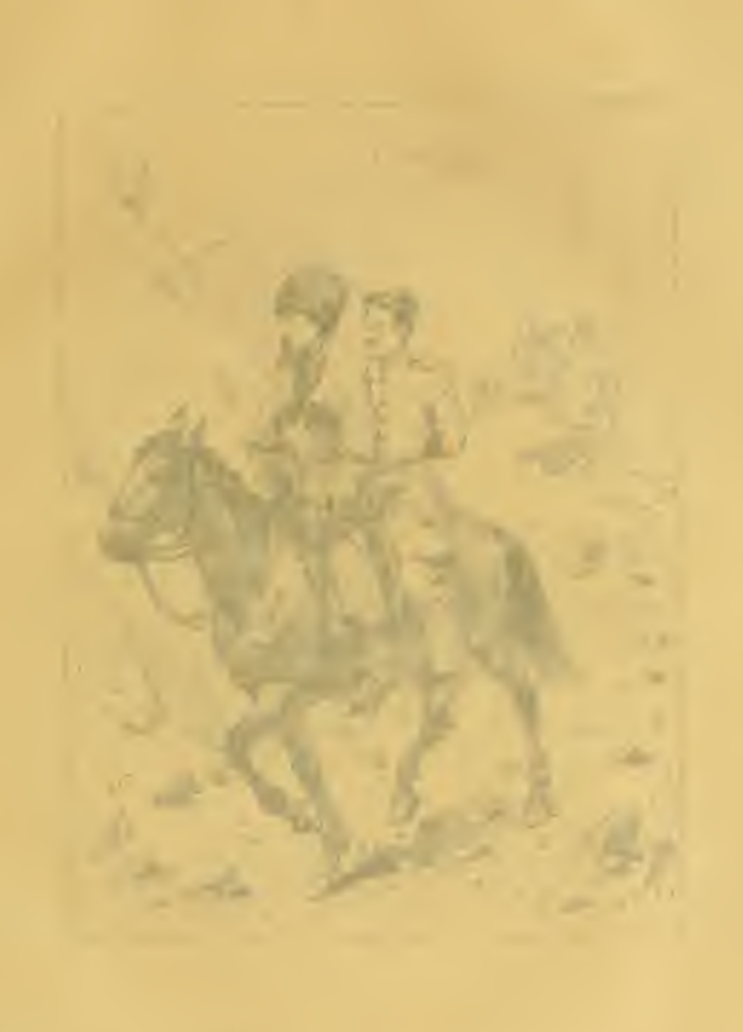
"They rode off to the mountains" Photograms, from Pant ( ) A Kinchinko