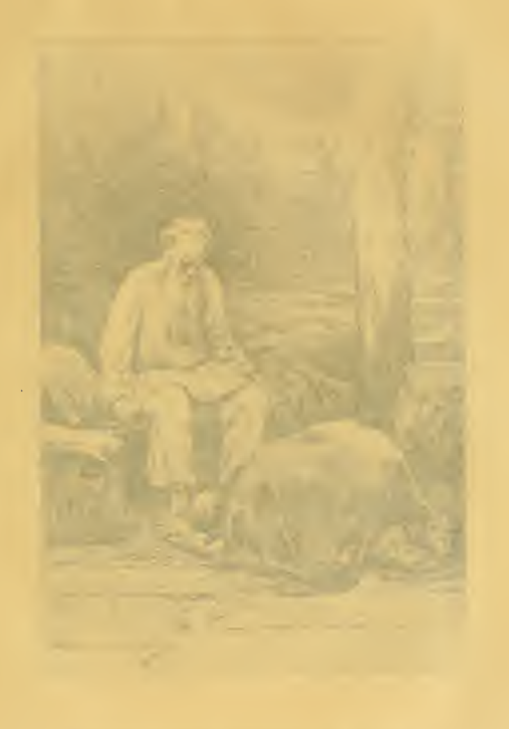
"God will torgive you""